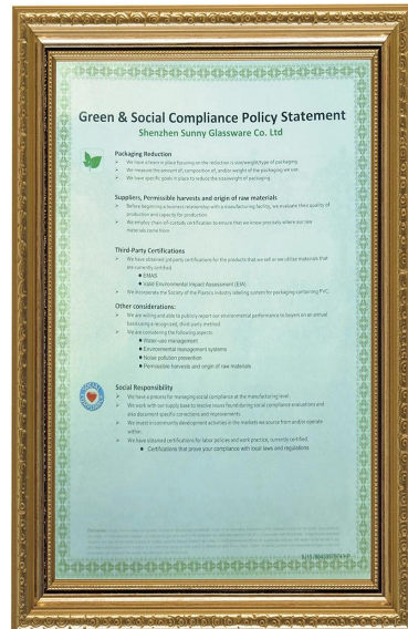
Uxanduva lohlaza kunye noluntu Ingxelo ka Polidy