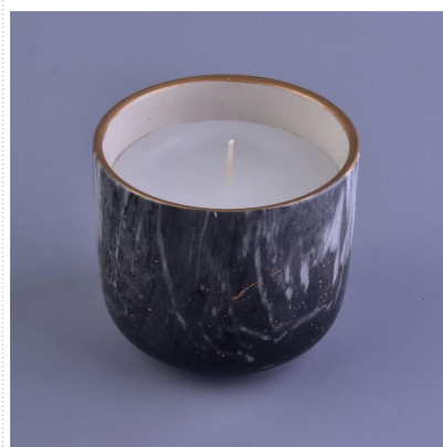
Marble amakhandlela enuka kamnandi kwisitya sekhandlela yodongwe kunye noshicilelo lweemabula