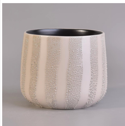
Matte emnyama ngaphakathi iingqavi zekhandlela ezimenyezelayo ezenziwe ngombala