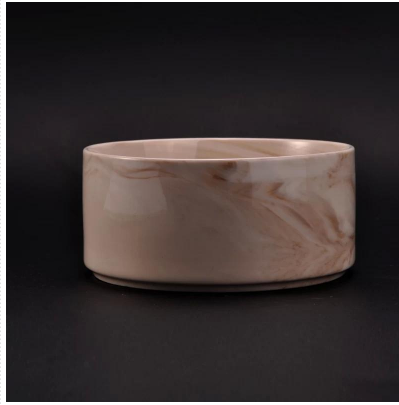
Intenqiso eshushu ye-matte emhlophe emhlophe yekhandlela isitya sevumba lasekhaya