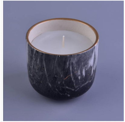
Marble amakhandlela enuka kamnandi kwisitya sekhandlela yodongwe kunye noshicilelo lweemabula