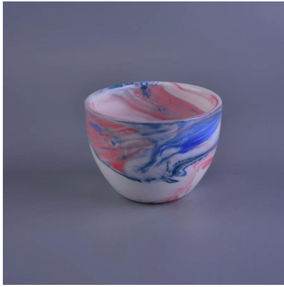
Ukuhonjiswa kwesoyile eyenziwe ngodongwe eyenziwe ngengqayi yekhandlela enevumba elimnandi