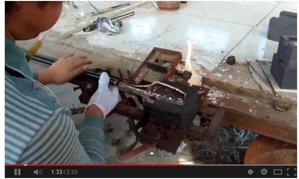
Itekhnoloji yesandla evuthuzayo