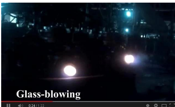
Itekhnoloji yoMatshini eVuthelweyo

Nantsi indlela yokubukela imveliso yethu yevidiyo kwi-intanethi, kwaye wamkelekile ukusityelela kwisayithi.