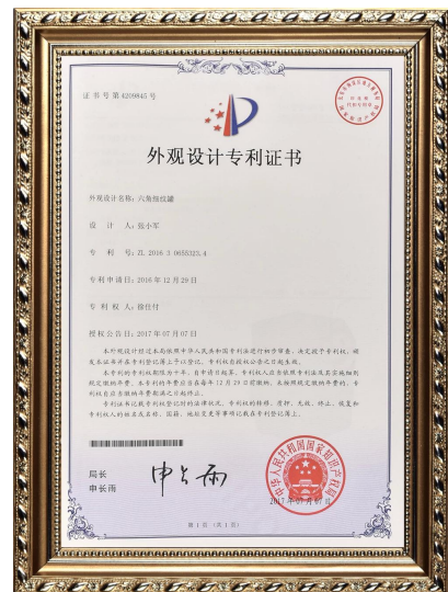
Ilungelo elilodwa lomenzi wechiza 20163065323.4