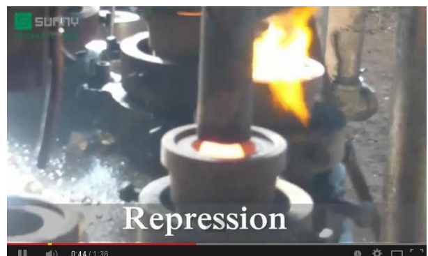
Itekhnoloji yoPapasho loMatshini