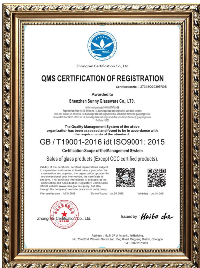
I-ISO 9001: 2015