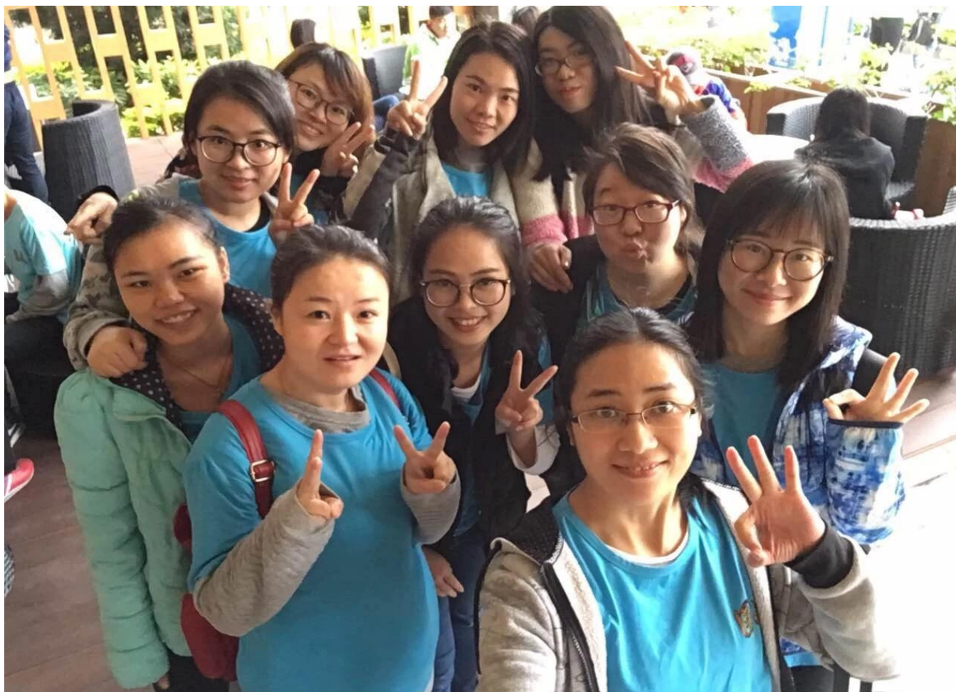
Igumbi lethu lokubonisa: