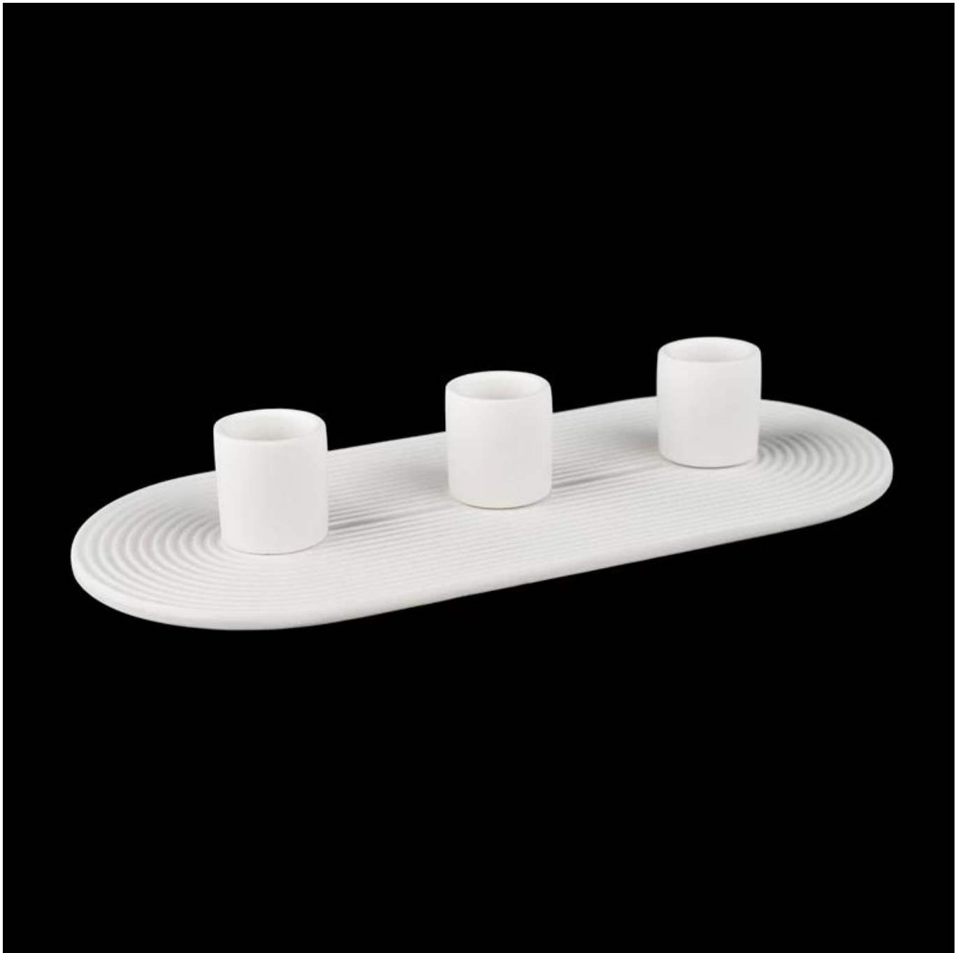
Ngezantsi kukho intonga enye