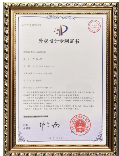
Ilungelo elilodwa lomenzi wechiza 201630655323.4